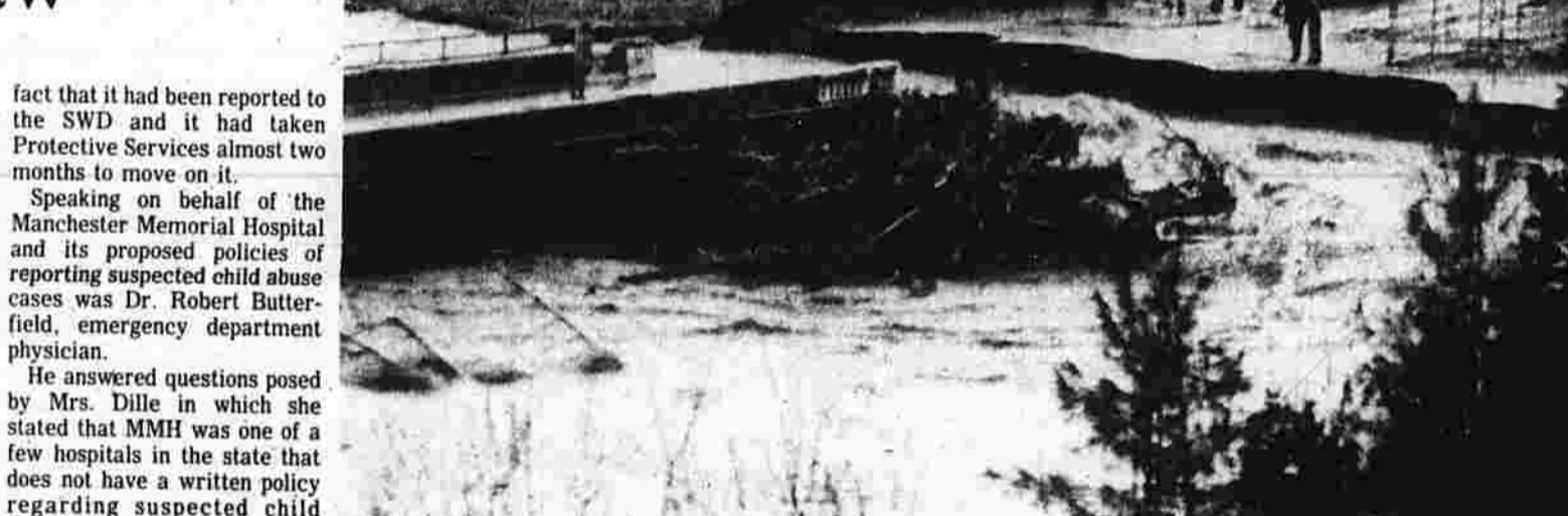
Stranded motorists (R) look at bridge that was washed away by rampaging Sacramento River. Bridge was used as alternate route for Interstate 5, when section of main road collapsed at Dunsmuir, Calif. Rivers and streams in Northern California poured over their banks forcing evacuation of families and halting passenger train service.

London Gold Price Nears Record High. LONDON - The price of gold climbed toward record levels today while the U.S. dollar market time on European money markets.